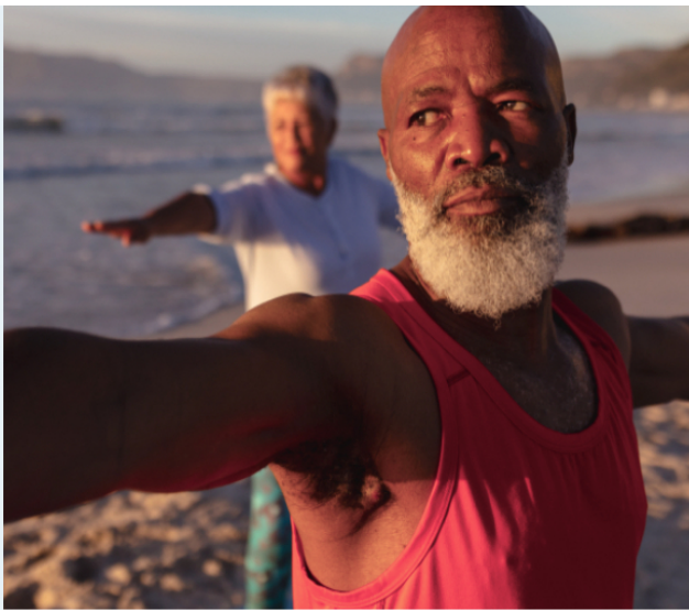
Balance exercises for seniors to help improve stability