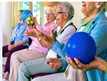
Seated and standing chair exercises for seniors