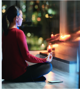
How online therapy apps can help with stress

Rewards have no cash value and can only be redeemed in the Go365 Mall. Programs vary. Please see your program details for specific rules.